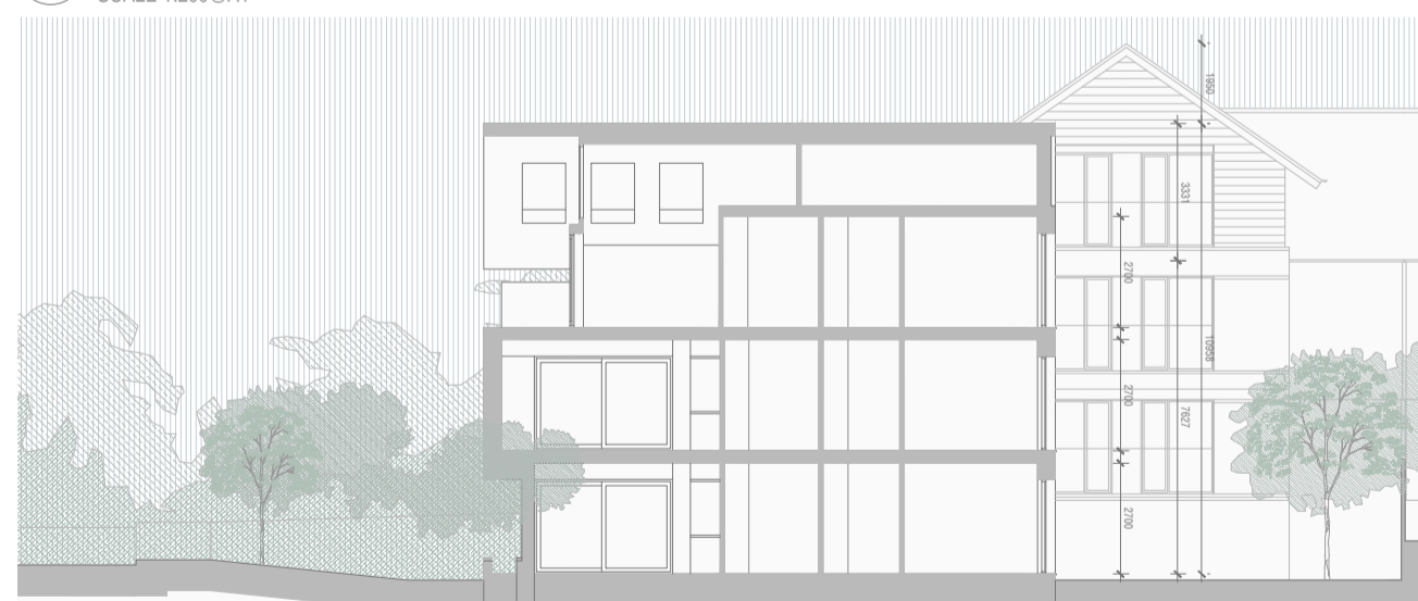
SECTION BB SCALE 1:200@A1