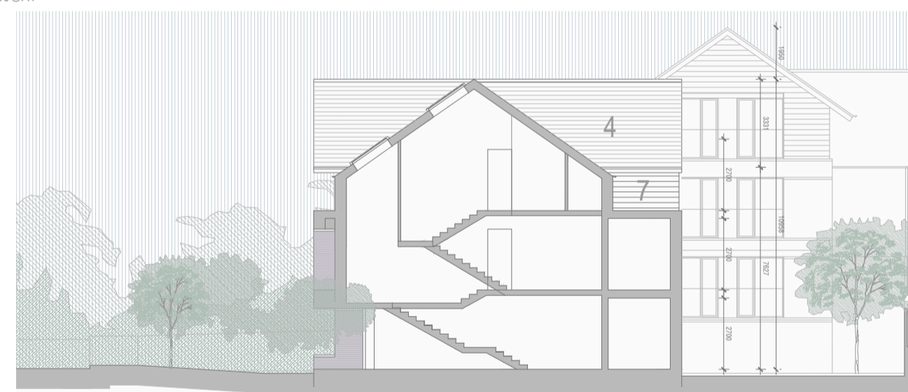
SECTION AA SCALE 1:200@A1