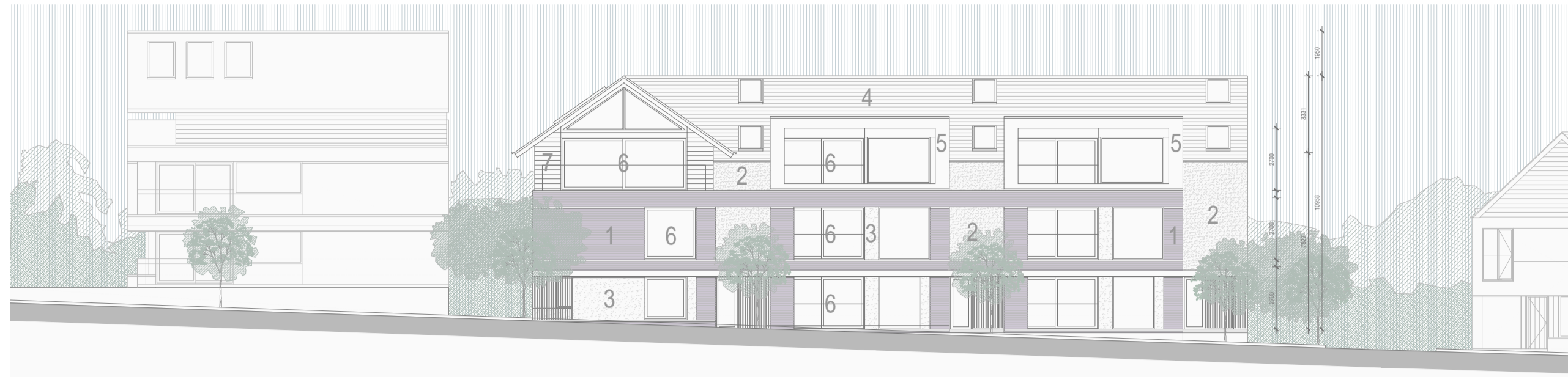
FRONT ELEVATION SCALE 1:200@A1