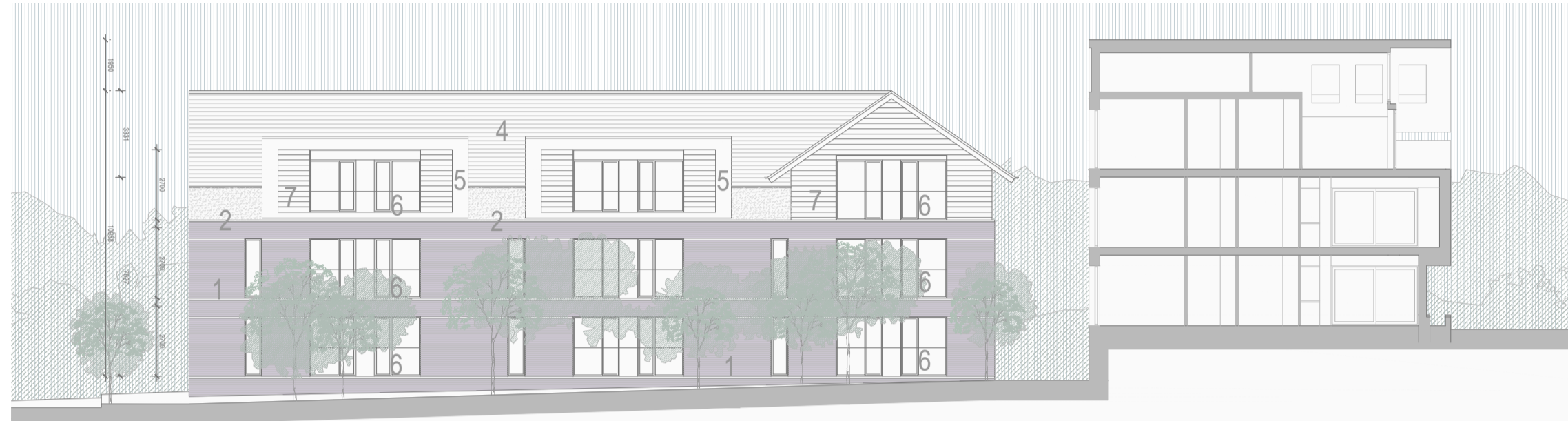
REAR ELEVATION SCALE 1:200@A1