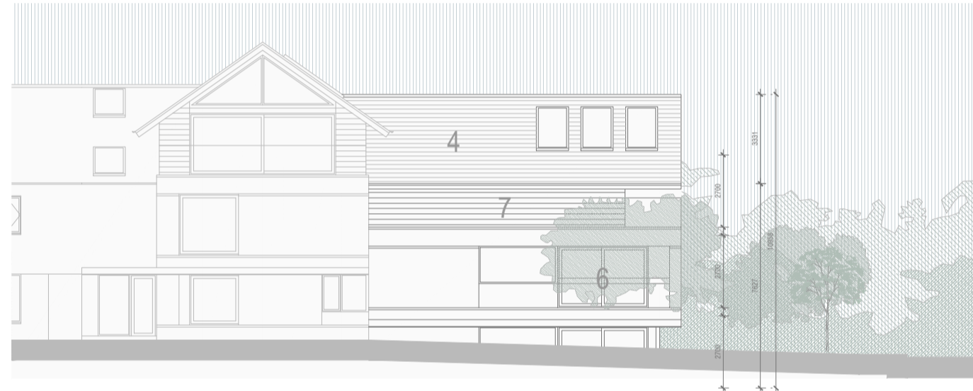
GABLE ELEVATION 1 - A SCALE 1:200@A1