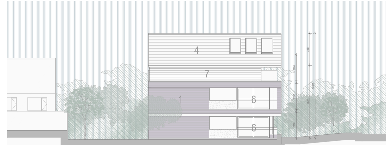
GABLE ELEVATION 1 - B SCALE 1:200@A1