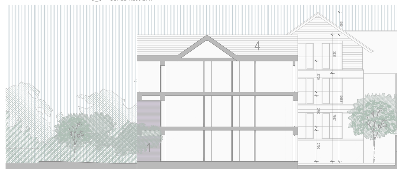
SECTION CC SCALE 1:200@A1